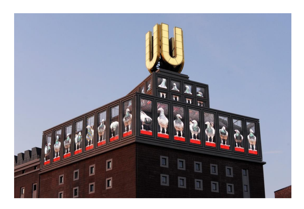
Dortmund U-Tower

For recommendations on what to do in Dortmund and surrounding cities of the Ruhr Area, you might want to have a look at <a href="https://www.ruhr-tourismus.de/en/">https://www.ruhr-tourismus.de/en/</a>